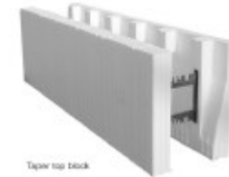
Taper top block